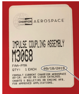
MANUFACTURED DATE LOCATED ON IMPULSE COUPLING REPLACEMENT KIT

THIS DOCUMENT SUBJECT TO THE CONTROLS AND RESTRICTIONS ON THE FIRST PAGE