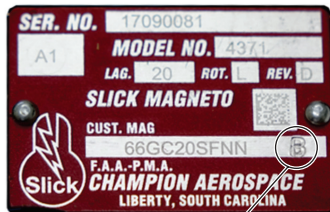
LETTER "B" INDICATES REPAIRED MAGNETO