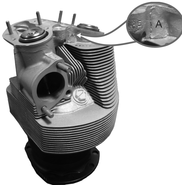
Figure 3. Identify Inspection Compliance with Vibro-Etch Mark